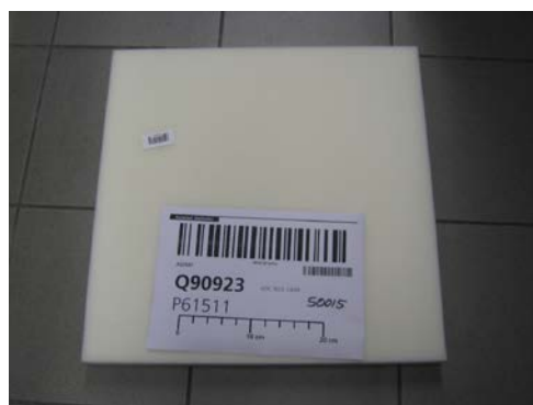
Photo of the tested sample part.