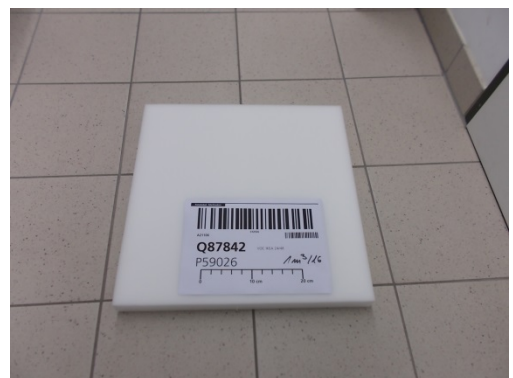
Photo of the tested sample part.