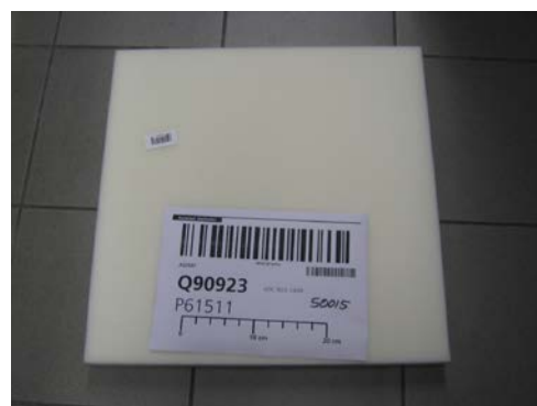
Photo of the tested sample part.